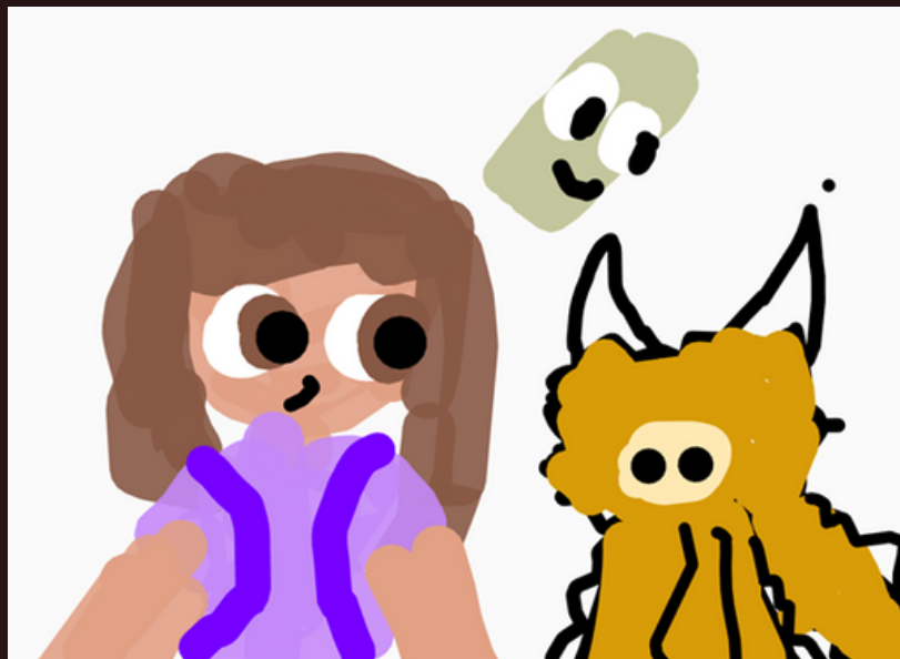
'Dora and Coo' by Amelia Aitken, P3

The P3-4 pupils have been learning to use paint vocabulary while experimenting with paint package tools to create pictures.